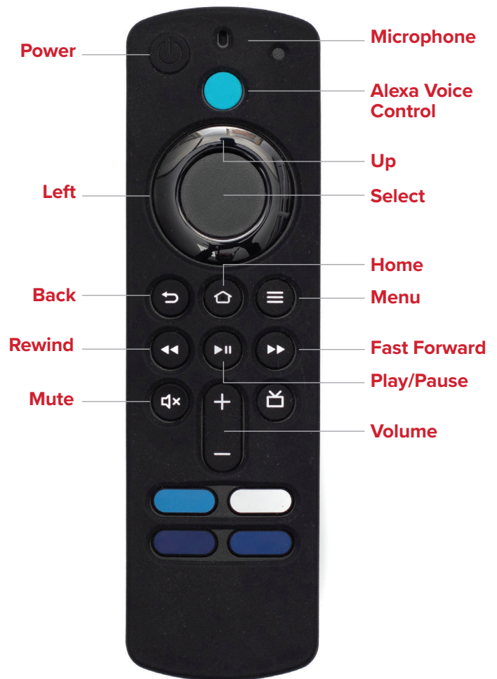
Standard Remote (with voice controls)

Adding another device to your existing TremoloTV subscription? See "Adding a New Device to Your TremoloTV Subscription" on the back.