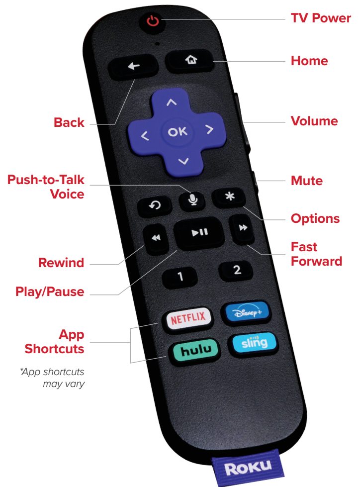
Voice Remote (Roku Pro Remote)